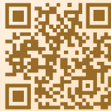
Master of Science in Organisation of Sports Event