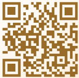
Master of Business Administration in Digital Transformation