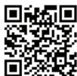
Programmes and Fees