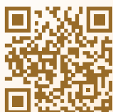
Master of Business Administration in Digital Transformation