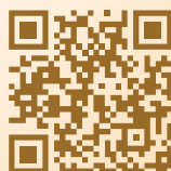
Master of Science in Organisation of Sports Event