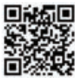
Programmes and Fees