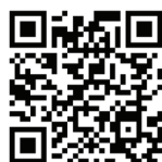
Programmes and Fees