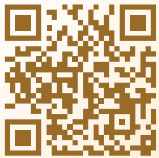
Master of Business Administration in Digital Transformation