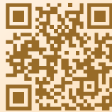
Master of Science in Organisation of Sports Event